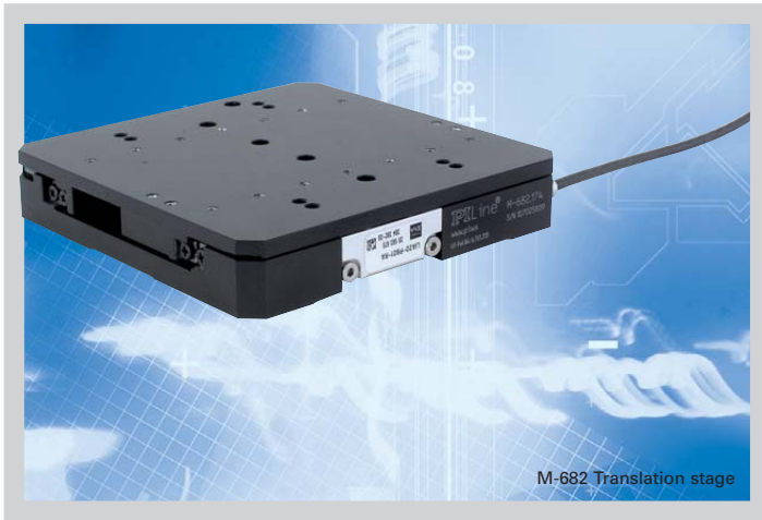
M-682 Translation stage